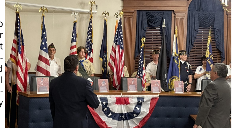
Troop 121 is recruiting! Any boys interested in joining are welcome to join them at any scheduled meeting.

They meet in Bethany's Fellowship Hall (Gym) every Monday 7:30–9:00 P.M.