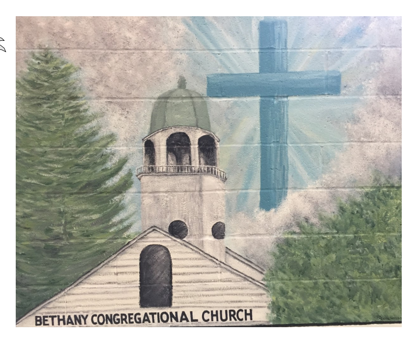
Mural in the Fellowship Hall

If you enjoy <u>The Bell Tower</u> and you would like to see your name here, please send a small donation to Bethany Church. It helps to offset costs. Thank you.