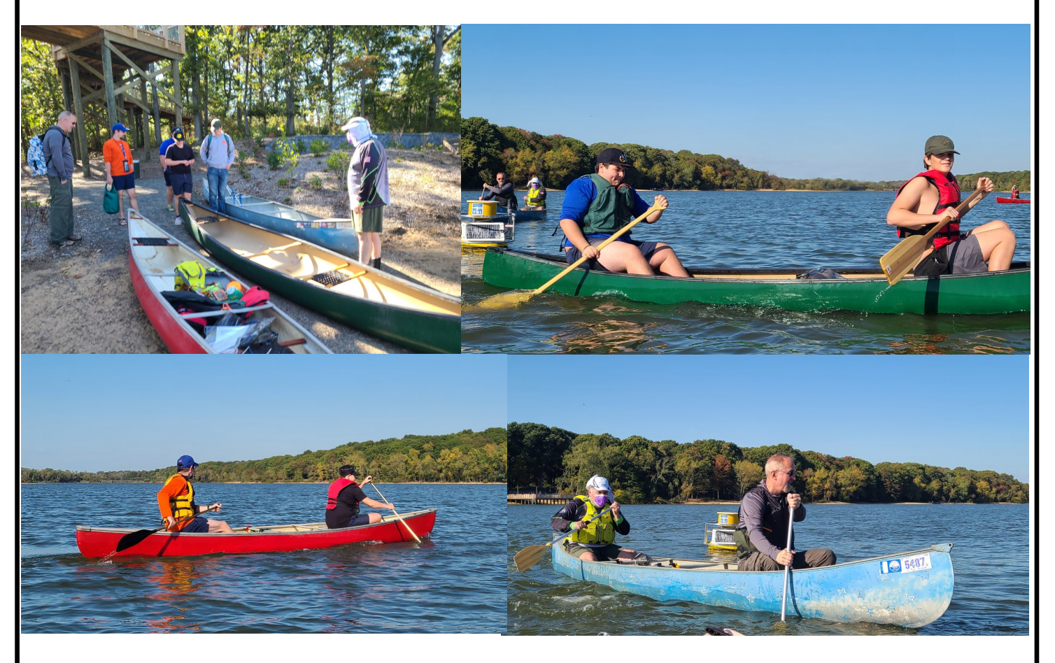
Troop 121 is recruiting! Any boys interested in joining are welcome to join them at any scheduled meeting. The meet in Bethany's Fellowship Hall (Gym) every Monday 7:30–9:00 P.M.

The Troop went canoeing at Hempstead Lake on October 10, 2022. A great time was had by all on a most beautiful autumn day.